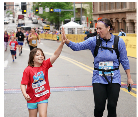
The Chick-fil-A Pittsburgh Kids Marathon