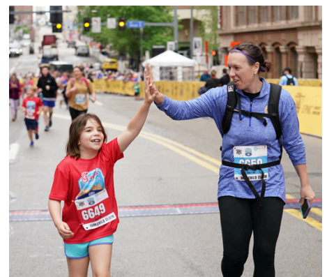
The Chick-fil-A Pittsburgh Kids Marathon