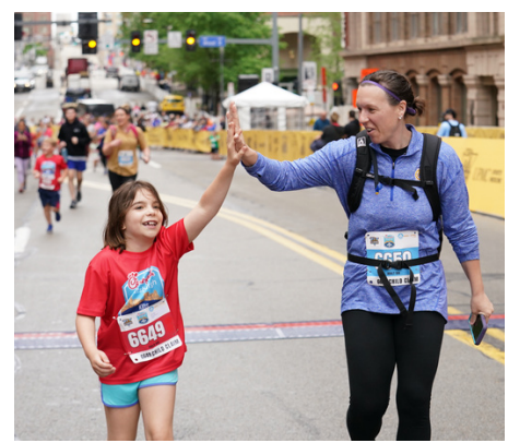
The Chick-fil-A Pittsburgh Kids Marathon